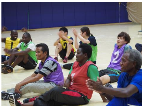
Game for Practical Work