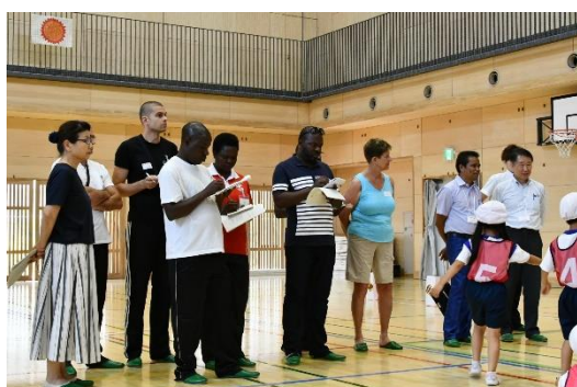
Observation in Primary School