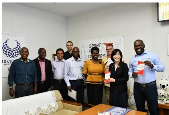
Visit to Sports Agency